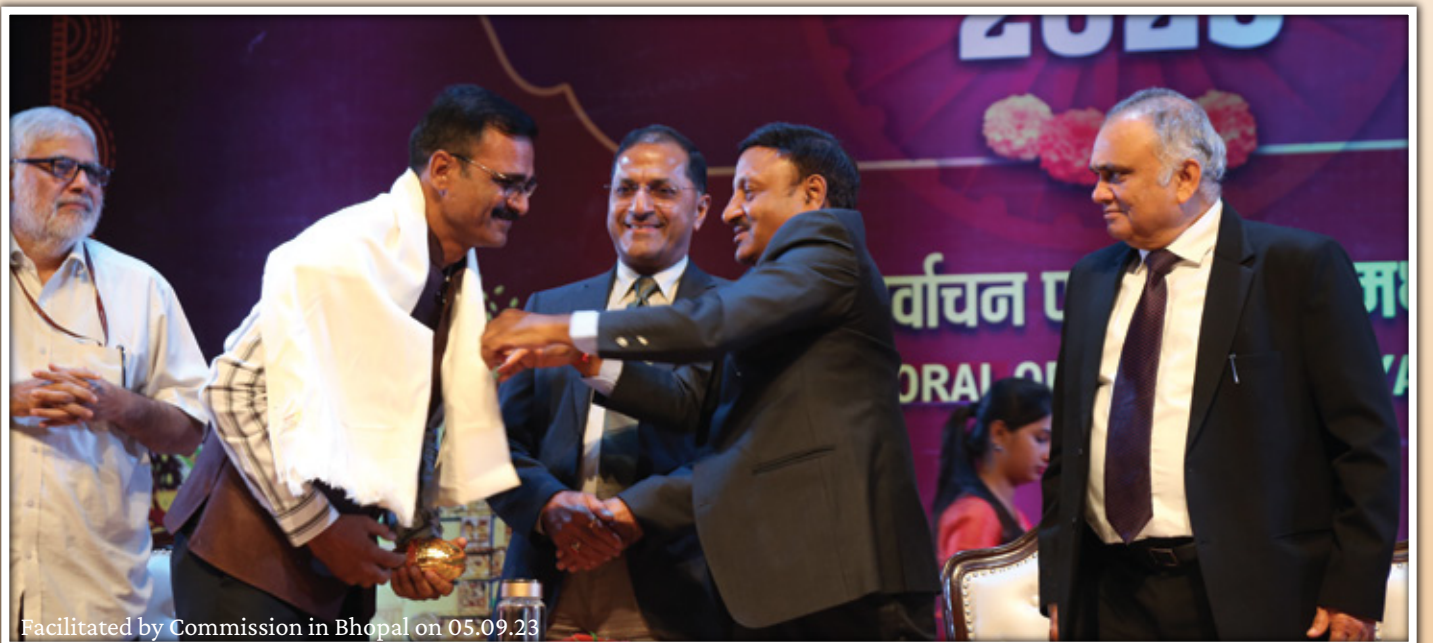
Facilitated by Commission in Bhopal on 05.09.23

During my household visits, I am received with respect and cooperation. My unique approach aids me in fulfilling my BLO responsibilities, which include the addition of new voters, the removal of deceased individuals' names, and updates on absentee voters. This supportive environment enables me to maintain an accurate and error-free Electoral Roll for my booth.