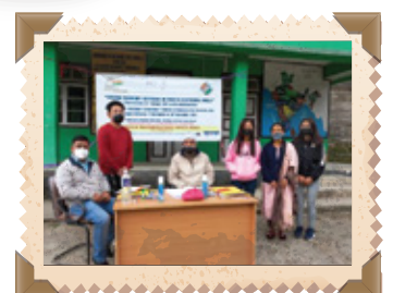
Glimpses of BLO conducting activities

Important: Pre-revision operations are to be given equal weightage with revision activities in order to produce high-quality electoral rolls.