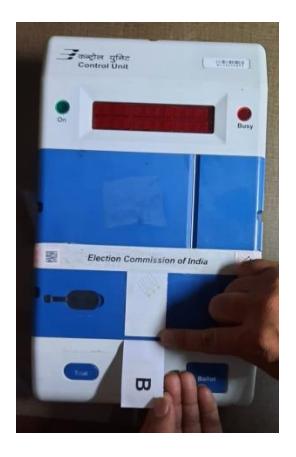
Affixing Green Paper Seal

2. Seal the drop box of VVPAT with Address Tag and ask polling agents also to sign it.