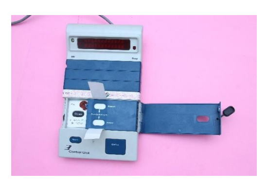
Sealing inner Result Section with Special Tag