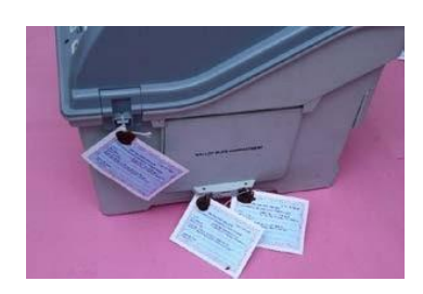
Sealing of Drop Box of VVPAT with Address Tag

2. Seal the drop box of VVPAT with Address Tag and ask polling agents also to sign it.